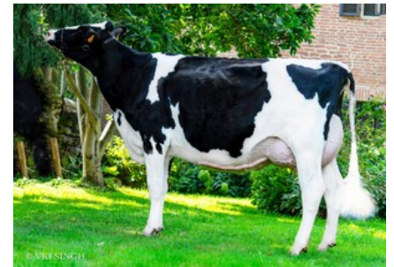
Fantasy GPlus Edera