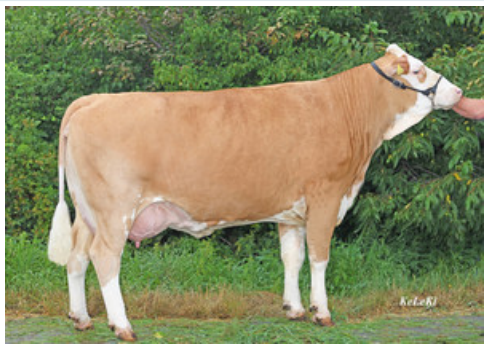
dam KOALA DE 09 51253484