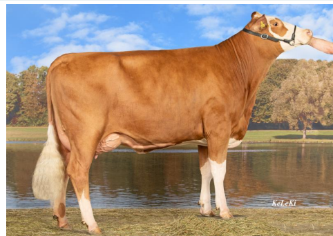
Kanada AT 69 9643 274 (in 1. lact.)