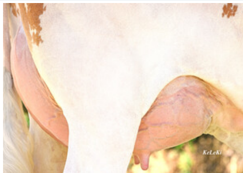
KLEOPAT DE 09 53654339