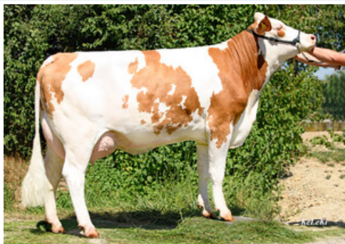
KLEOPAT DE 09 53654339