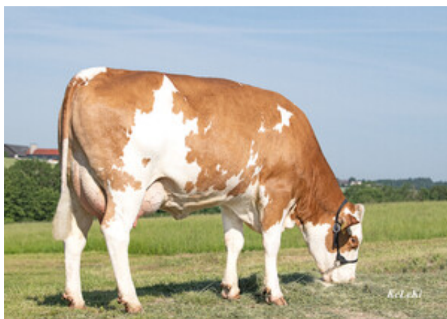
WIRBELWIND P*S - D WAIANA