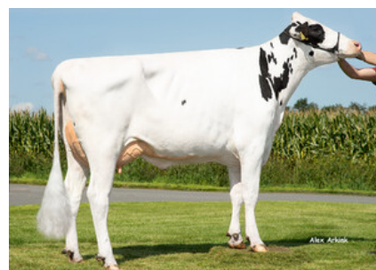
M: THH Universum