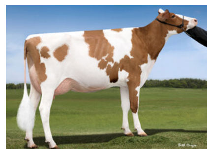
MMM: Snowbiz Sympatico Sofia Red