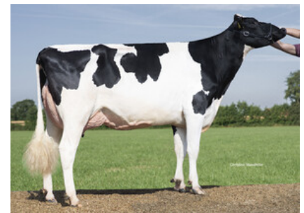
M: WIL Hoy