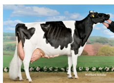
Stammkuh: Batkes Outside Kora EX 94