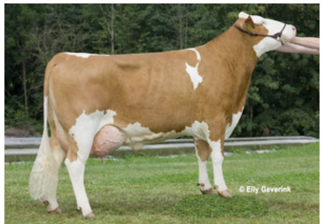
GS HENDORF - M RICO